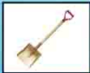
ANTI SPARK SHOWEL