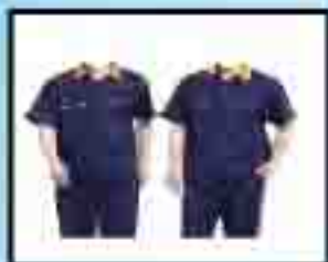
PENT & SHIRT UNIFORM