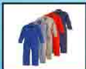
SAFETY COVERALL (MAKE TO ORDER)