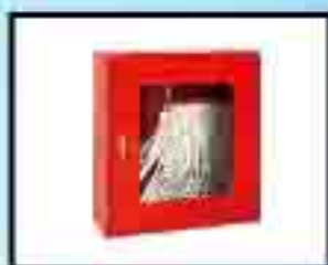
FIRE HOSE REEL BOX