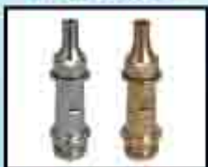
FIRE HOSE PIPE NOZZLE