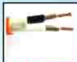
FIRE ALARM SYSTEM CABLE