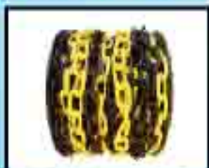
BARRICADE CHAIN RED & WHITE