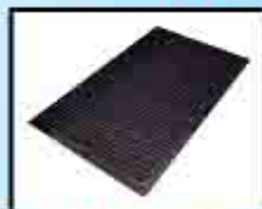
ELECTRICAL RUBBER MATT