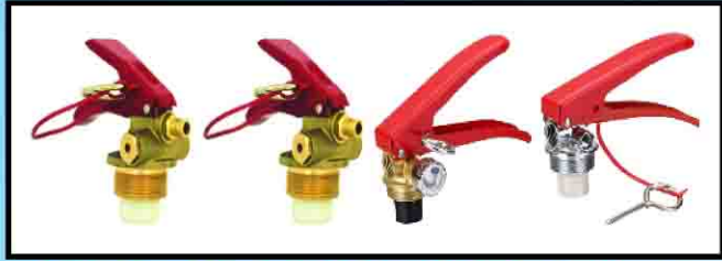
FIRE EXTINGUISHER VALVE