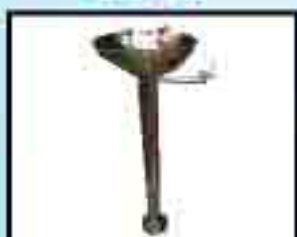
EYE WASH FLOOR MOUNTED