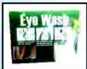
EYE WASH SHEET