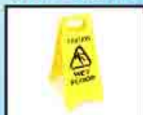
WET FLOOR SIGN