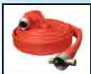
FIRE HOSE PIPE 1.5", 2" & 2.5"