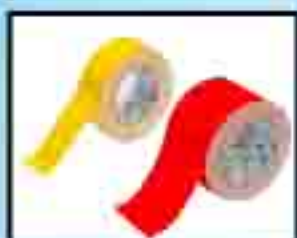
FLOOR MARKING RED TAPE 2" & 3"