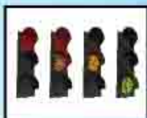
TRAFFIC SIGNAL LIGHTS