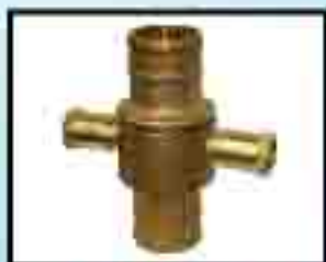
FIRE HOSE PIPE COUPLING