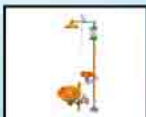
FULL BODY SHOWER