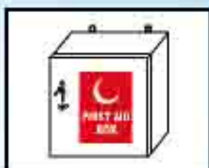
FIRST AID BOX WOODEN