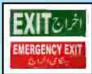
EXIT / EMERGENCY LIGHT FM