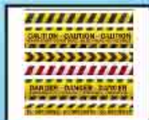
BARRIER TAPES & SELF ADHESIVE TAPES