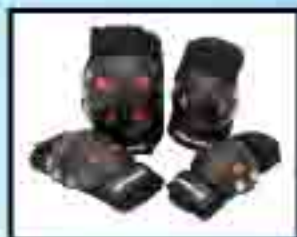
ELBOW & KNEE GUARD