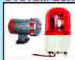
HOOTER & REVOLVING LIGHT