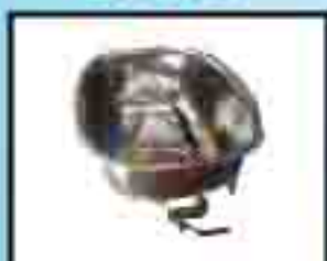
EYE WASH WALL MOUNTED