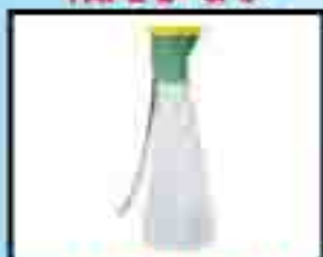
EYE WASH BOTTLE