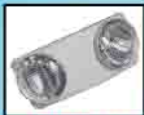
BIG BEAM LIGHTS