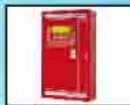
FIRE ALARM SYSTEM BOX