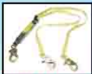
SINGLE & DOUBLE SHOCK ABSORBER