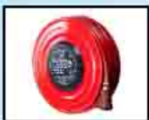
FIRE HOSE REEL 1"