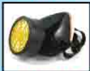
HALF FACE MASK NP-305