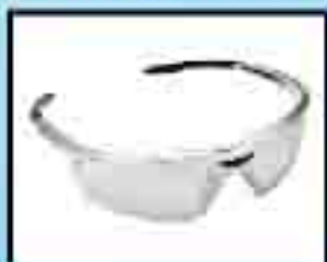
SAFETY SPECTACLE FOCUS