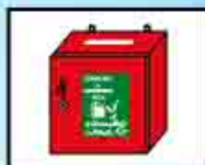
COMPLAINT BOX WOODEN