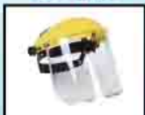
SAFETY FACE SHIELD