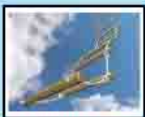
EMERGENCY ROPE LADDER