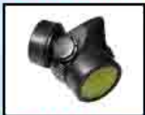
HALF FACE MASK NP-306