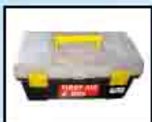
FIRST AID BOX PLASTIC