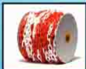
BARRICADE CHAIN RED & WHITE