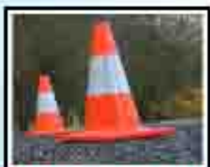
TRAFFIC CONE 18" & 28"