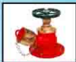
FIRE HYDRANT VALVE