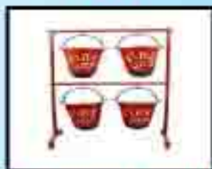
4 BUCKET WITH STAND