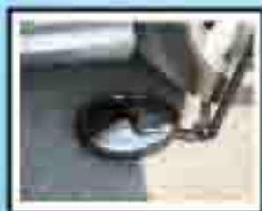
VEHICLE SEARCH MIRROR