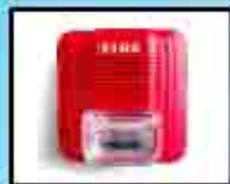
SOUNDER WITH FLASHER