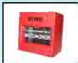
EMERGENCY BREAK GLASS