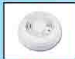
SMOKE ALARM 9V