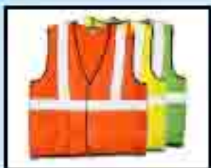
REFLECTOR JACKET TAIWAN