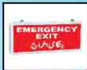
EMERGENCY EXIT LIGHT